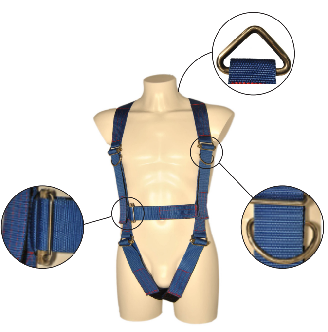
Compliant with Standard EN 250:2006